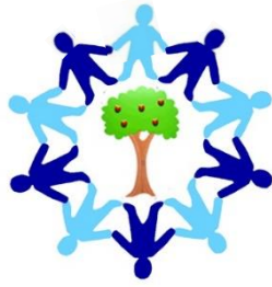
Hardwick and Cambourne Community Primary School